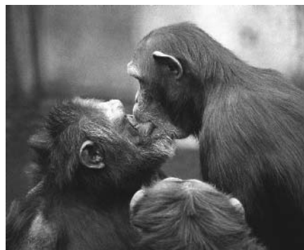
The kiss: chimpanzee communication is based on interactions, according to dynamic systems theory.

By isolating and formally defining a quantity termed information, which has surprising affinities to the physicists' concept of entropy, Shannon and Wiener planted the seeds of today's digital world, where diverse types of information can be transformed, stored or transmitted as a pattern of binary digits (or 'bits', a term they introduced). Shannon and Wiener were acutely aware that information (a measurable quantity of signals) is not to be confused with meaning (which depends on context and interpretation, and exists in the eye of the beholder). They both explicitly set aside 'meaning' as a topic for future work, and it remains formally undefined today.