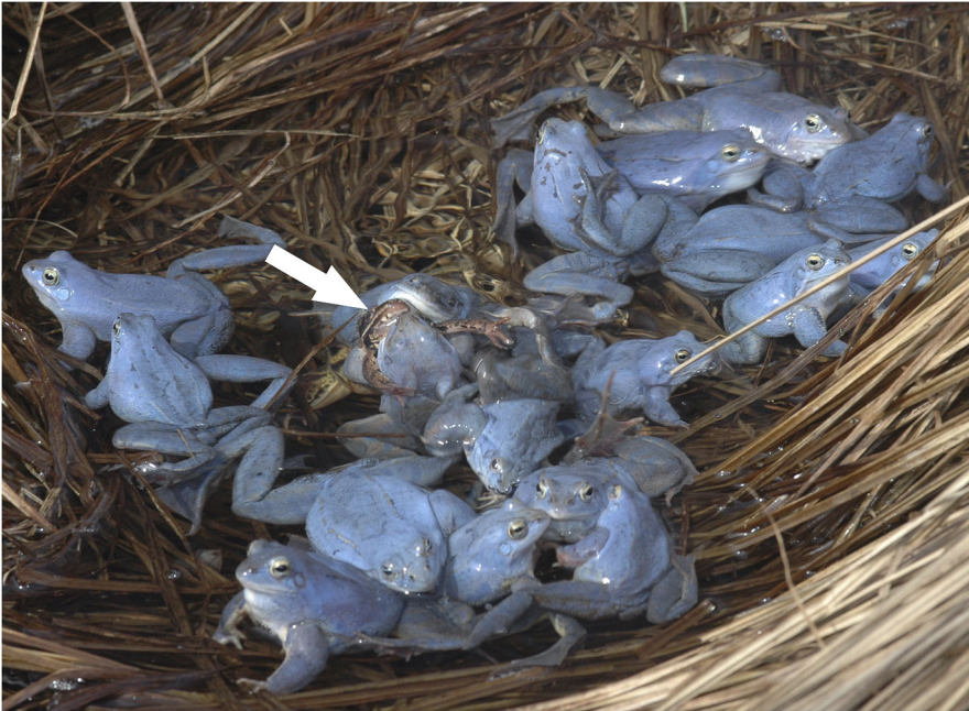
Figure 1. A female moor frog ( Rana avails , white arrow) within a group of blue coloured males. This figure is published in colour in the online edition of this journal, which can be accessed via http://booksandjournals.brillonline.com/content/journals/1568539x .

pers. obs.). Females lay one, sometimes two clutches per breeding season (Glandt, 2006). We counted approximately 70 egg clutches per \text{m}^2 at communal spawning sites.