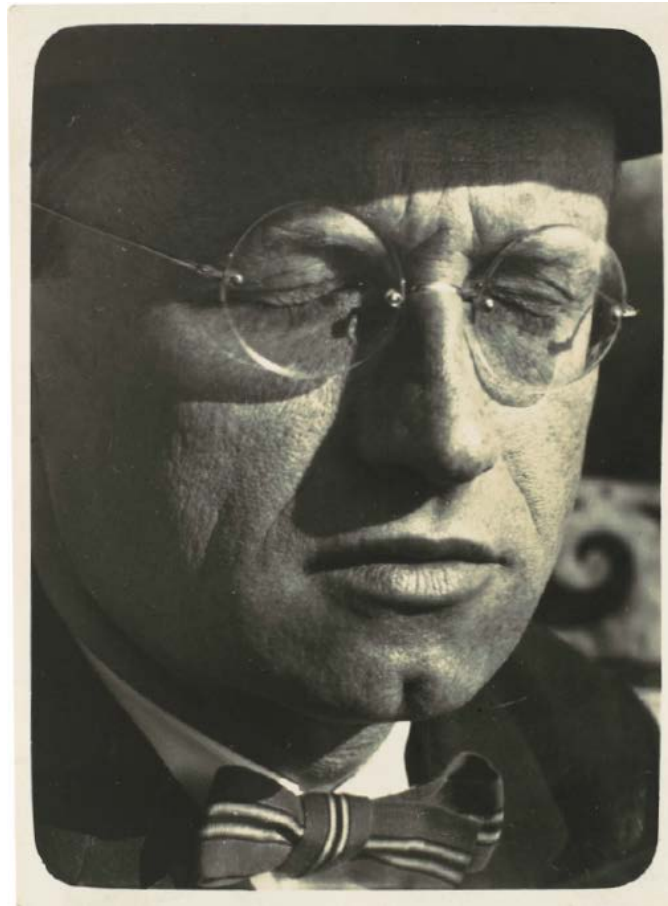
Franz Roh 1890-1965