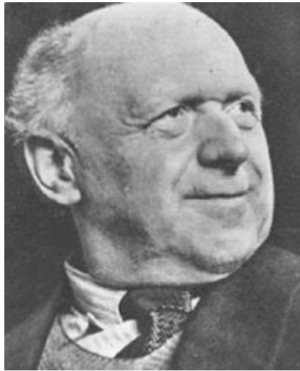
Otto Neurath 1882-1945